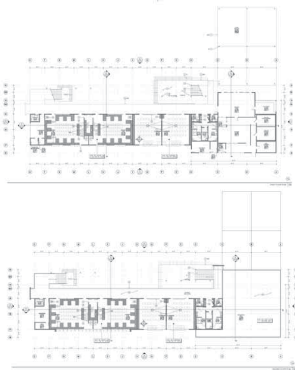
Site Map and Scope of Work